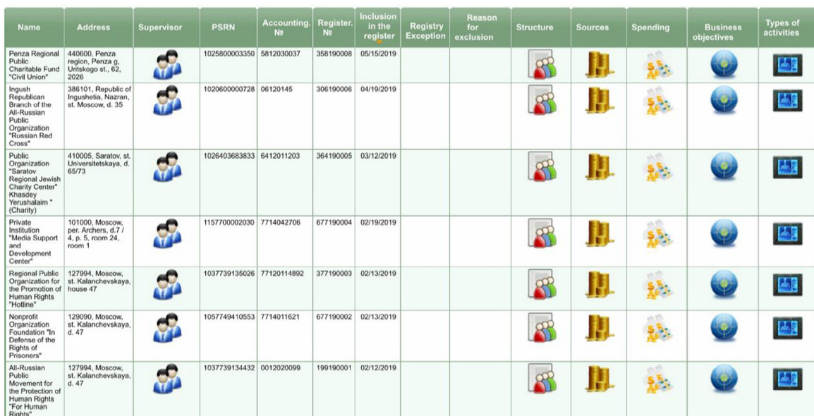
Fig. 2. The ‘foreign agents’ register ( http://unro.minjust.ru/NKOForeignAgent.aspx ).

Initially, the ‘foreign agents’ law required NGOs that received foreign funding and were involved in political activism to voluntarily register themselves as ‘NGOs performing the functions of a foreign agent’. However, the perverse consequences and backlash associated with being perceived as a foreign agent resulted in (unsurprisingly) no Russian NGOs putting their names on the register (Skibo, 2017). In response, the government amended the law to empower the Ministry of Justice to compulsorily register NGOs that were found to be engaging in political activism and to be receiving foreign funding, following the results of inspections (Sevortian, 2013).